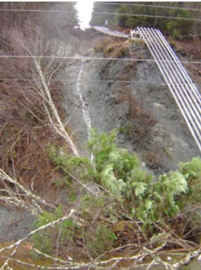
Photo 3: Lutak hwy mile 5 Delta Western Tanks Farm Header System (trees sliding into powerlines), November 2005 Storm.