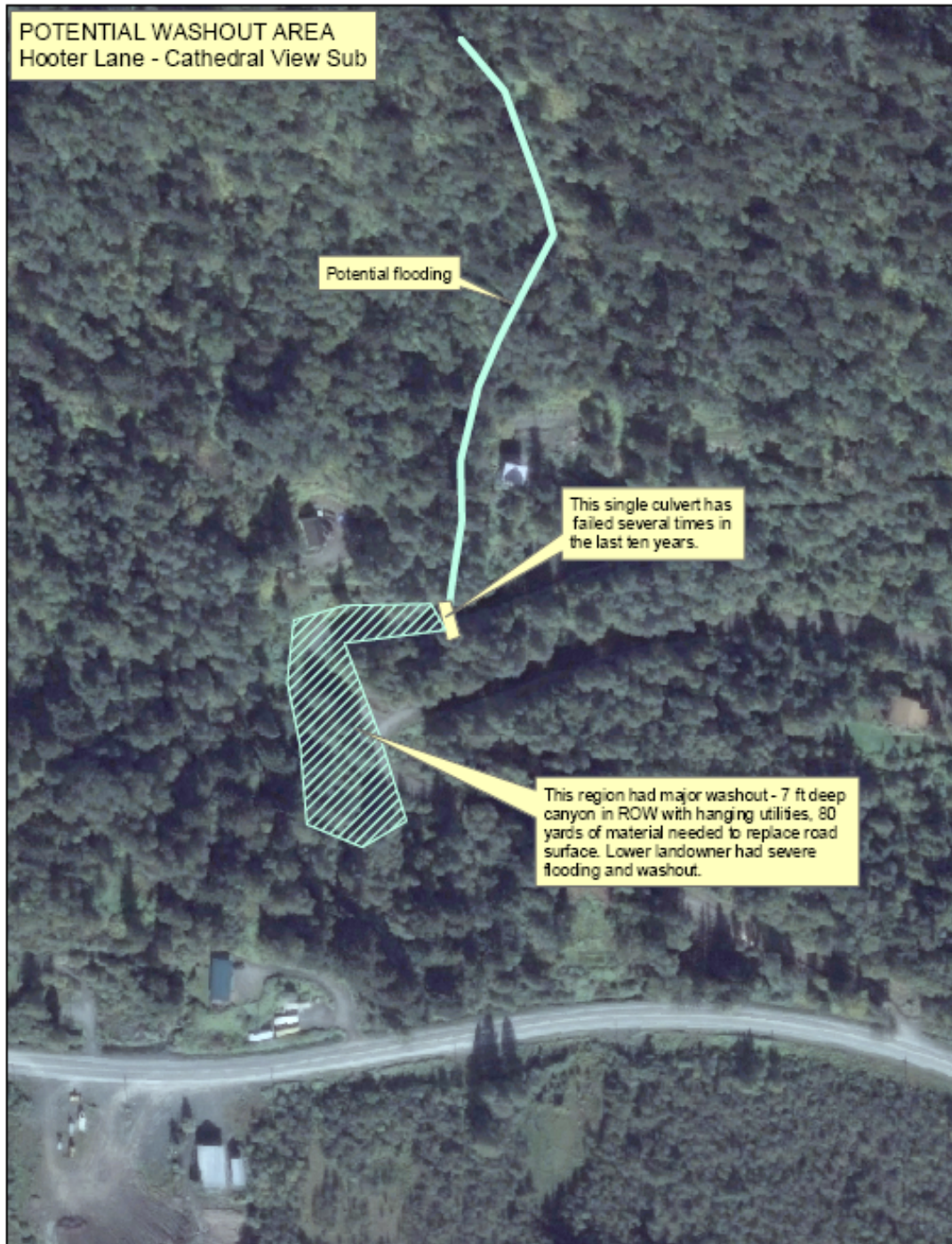
Diagram provided by Takshanuk Watershed Council showing erosion trouble spots in Haines Borough.