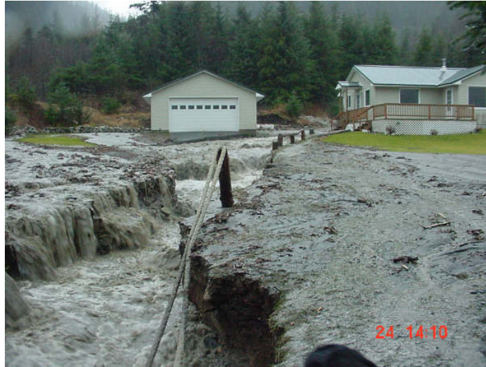
Photo 2: Lutak Highway mile 9; Belaski residence, Nov. 2005 Storm.