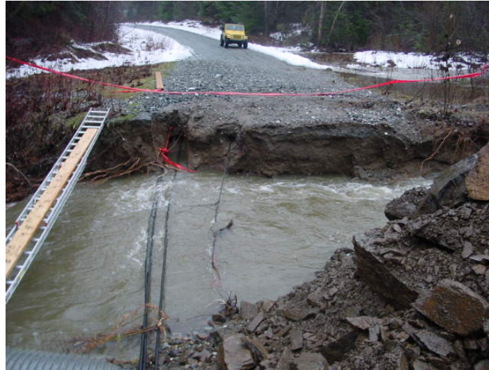
Photo 4: River Drive mile 2; Mosquito Lake Road, November 2005 Storm.